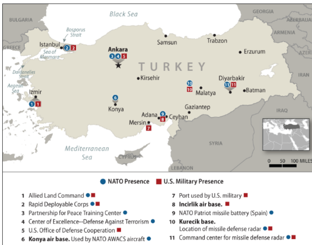
Figure 3. Map of U.S. and NATO Military Presence in Turkey