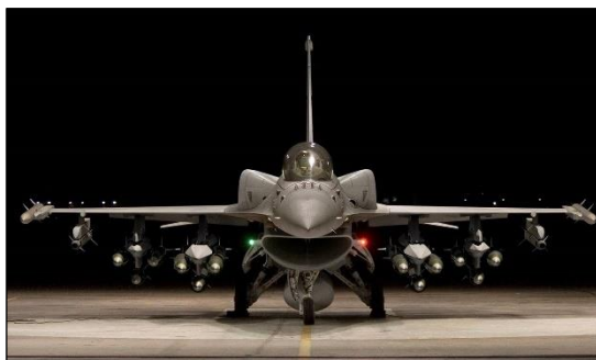
Figure 1. F-16 Block 70/72 Viper

The F-16 proposal takes place within a context of complicated U.S.-Turkey relations, and at a time when a number of U.S. allies and traditional partners are evaluating their strategic options in an era of global great-power competition. 4 A March 2023 Wall Street Journal article identified Turkey, Saudi Arabia, the United Arab Emirates (UAE), and India as “midsize powers” seeking